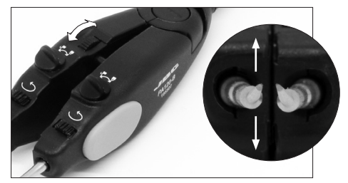
The tail wheel guarantees that the cartridges are equally aligned with vertical symmetry.

(1) Once the alignment has been made, do not forget to fix the cartridges by tightening the fixing knobs. A single turn of the knob is required to get them fixed.