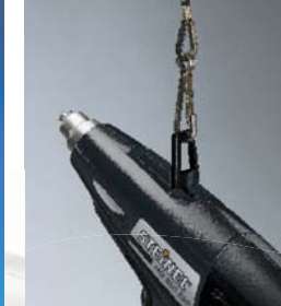
LED light provides bright illumination of the work area and also serves as a convenient "on" indicator