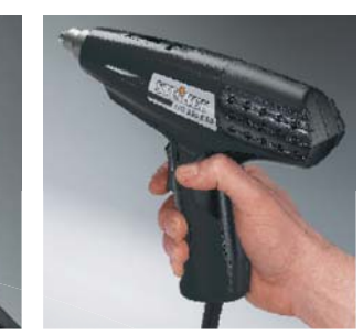
Optimised weight balance ensures fatigue-free long term operation